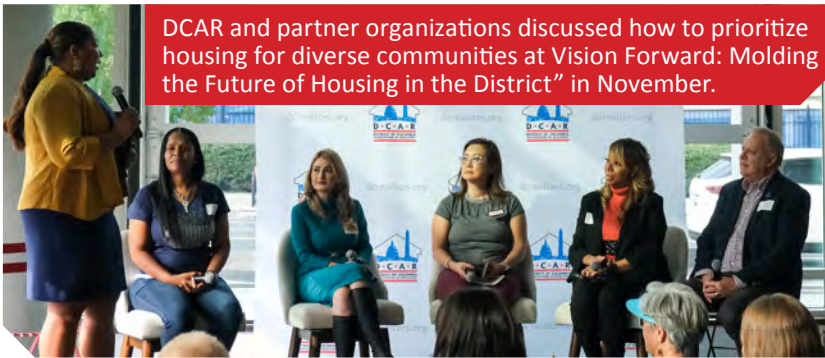
DCAR and partner organizations discussed how to prioritize housing for diverse communities at Vision Forward: Molding the Future of Housing in the District in November.