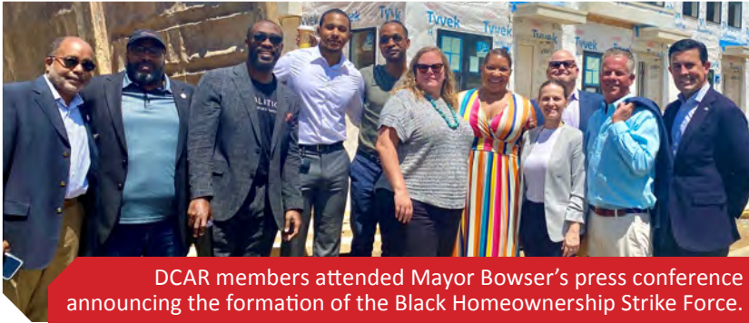
DCAR members attended Mayor Bowser's press conference announcing the formation of the Black Homeownership Strike Force.